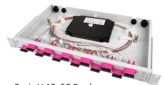
Basis V 12xSC Duplex