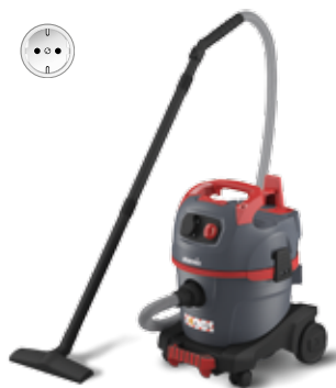
NSG uClean ADL-1420 EHP without filter cleaning, for low/normal dust emission, 20l container