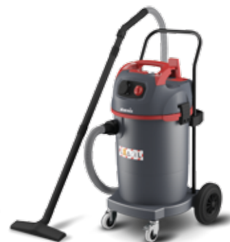
NSG uClean ADL-1445 EHP without filter cleaning, for low/normal dust emission, 45l container