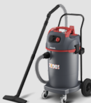
NSG uClean ARDL-1445 EHP with automatic filter cleaning, for normal dust emission, 45l container