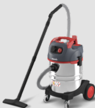
NSG uClean ARDL-1435 EHP with automatic filter cleaning, for normal dust emission, 35l container