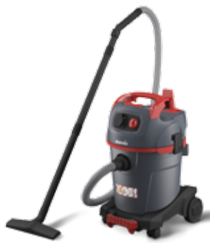
NSG uClean ADL-1432 EHP without filter cleaning, for low/normal dust emission, 32l container