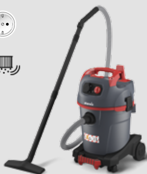
NSG uClean ARDL-1432 EHP with automatic filter cleaning, for normal dust emission, 32l container