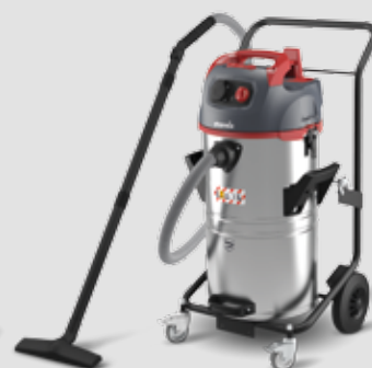
NSG uClean ARDL-1455 EHP KFG with automatic filter cleaning, tilting running gear and 55l container