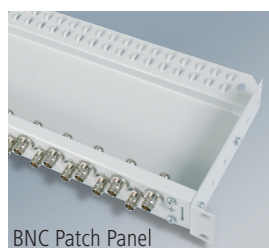
BNC Patch Panel