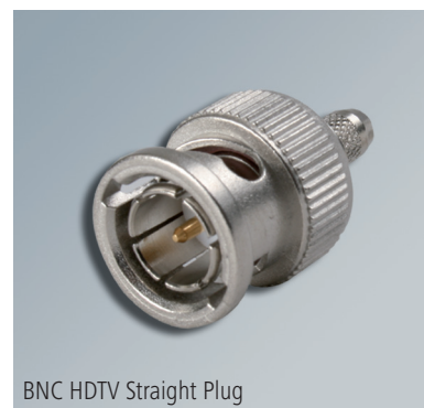
BNC HDTV Straight Plug