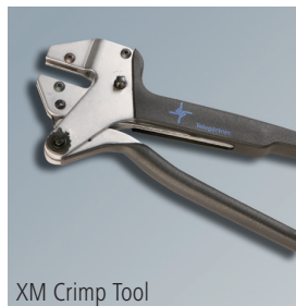
XM Crimp Tool