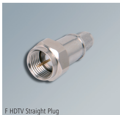
F HDTV Straight Plug

The so-called High Definition Television (HDTV) places far higher electrical demands on the 75 Ohm BNC- and F-connectors commonly used, in order to improve the system Return Loss performance and, therefore, the signal reflection, up to a frequency of 3 GHz. For this reason, Telegärtner has specially developed a new series of 75 Ohm BNC- and F-connectors with extremely high impedance matching, resulting in excellent Return Loss values (typically -30 dB min up to 3 GHz). Unlike standard F-connectors, all the Telegärtner designs include a centre contact.