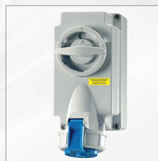
Surface Mounting Socket Outlet Schuko Type