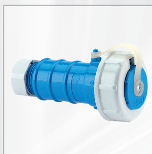
Connector Schuko Type