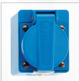
Surface Mounting Socket Outlet Schuko Type