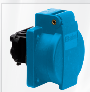
Panel Mounting Socket Outlet Schuko Type