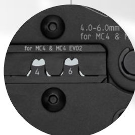
The crimping dies for 4 and 6 mm 2 crimp the standard MC4® and the even more robust MC4® EVO 2 connectors