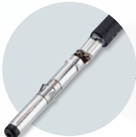
For very good crimping results: crimps quickly and cleanly