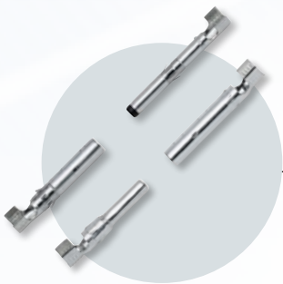
For MC4®- and MC4® EVO 2 connectors

The ratchet crimping mechanism opens the pliers once the optimum crimping pressure has been reached – automatically and by means of a spring