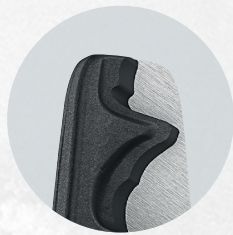
Slim head for better accessibility