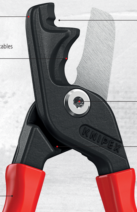
Handle shape allows gripping close to the joint and with one hand