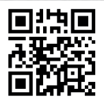
Further information on the KNIPEX StepCut® XL