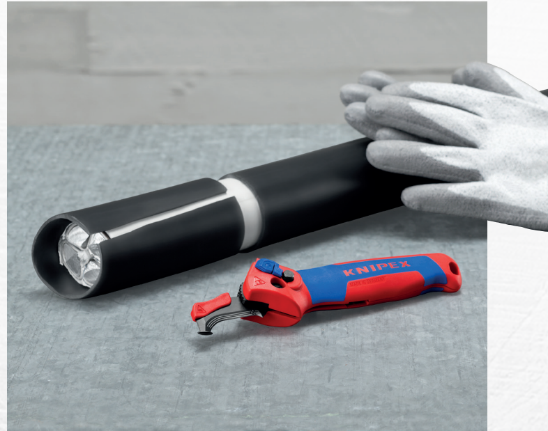
With three cutting areas, guide shoe and ratchet function: ideal for for tough cable sheaths