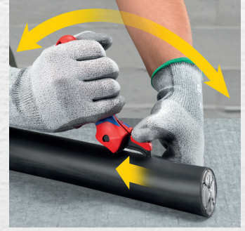
Ratchet function enables stripping with more comfort and less effort