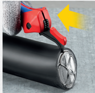
For pushing or pulling: two blade segments for lengthwise cutting