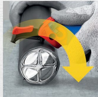
Third blade segment for round cutting