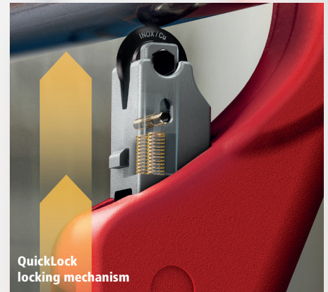
QuickLock locking mechanism

The spring-loaded cutting wheel keeps the KNIPEX TubiX® XL in place and prevents slipping.