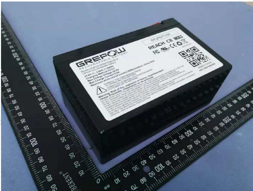
Figure 1 Overall view I of battery (电池外观图I)