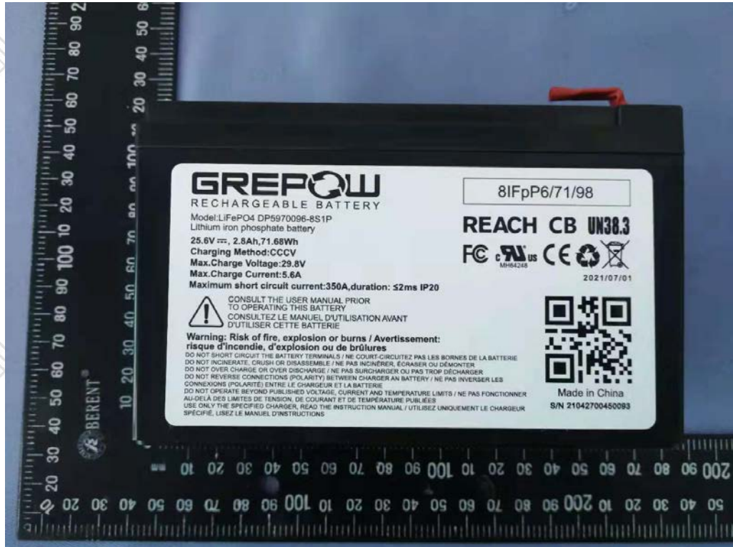
Figure 4 Battery label (电池标签)