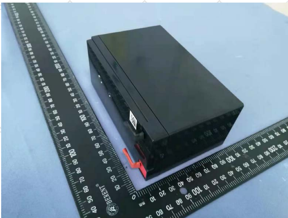
Figure 2 Overall view II of battery (电池外观图II)