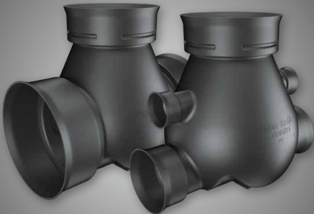
Shafts for road drainage